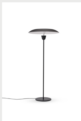
Item No: 22150 Variant: Black