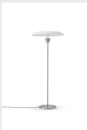
Item No: 22151 Variant: Nickel Plated